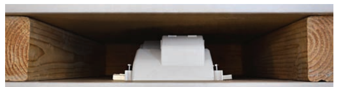
Top View - Mounted Between Studs

45-0024-WH Recessed Pro-Power Kit with Duplex Receptacle and Straight Blade Inlet, White 1/6