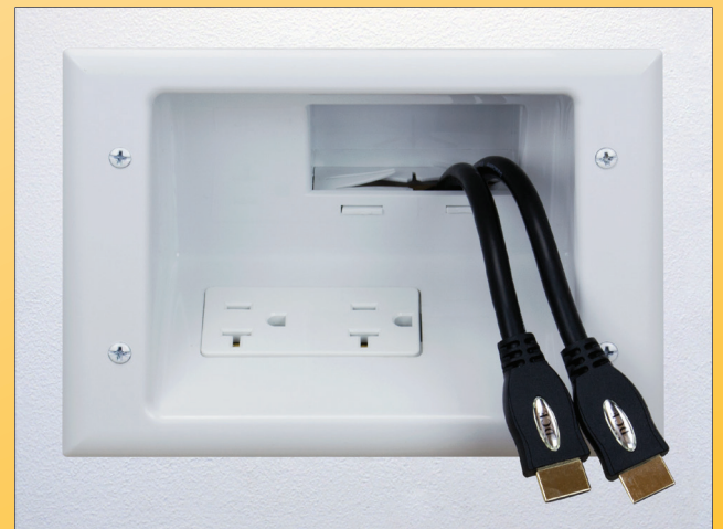
Final Installation with Compatible Wall Plate (Part #45-0071-WH)