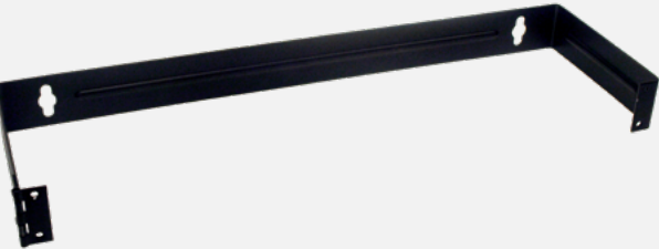
20-5552 2U Hinged Wall Mount Bracket